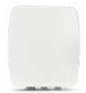
RADWIN 2000 A with 17dBi or Connectorized antenna