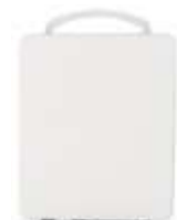
RADWIN 2000 D+ Connectorized