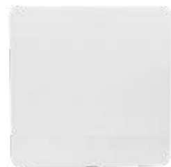
RADWIN 2000 Alpha 22dBi integrated