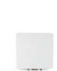
RADWIN 2000 Alpha 16dBi embedded