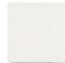
RADWIN 2000 C with 23dBi antenna

Delivering up to 200 Mbps throughput and up to 16 E1s/T1s, RADWIN 2000 C is ideal for operators seeking a carrier-class solution with guaranteed QoS. RADWIN 2000 C Series is available with a 23dBi integrated antenna or as a connectorized unit.