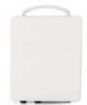
RADWIN 2000 C Connectorized