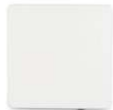
RADWIN 2000 D+ 23dBi

RADWIN 2000 D+ Series radios deliver 750 Mbps